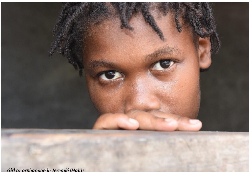
Girl at orphanage in Jeremié (Haiti)