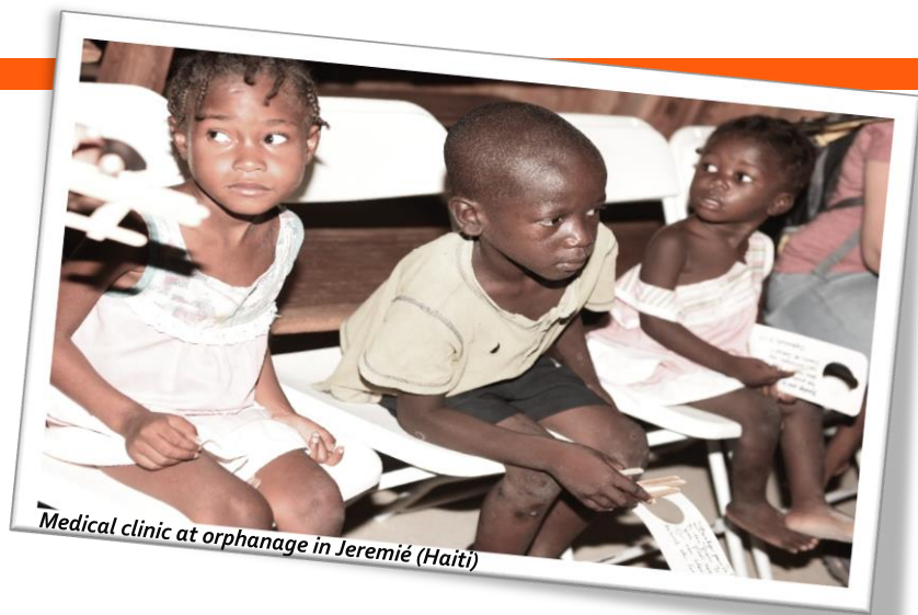
Medical clinic at orphanage in Jeremié (Haiti)

NowGen is The Rock's term for youth ministry. What we discovered is that St. Lucia has nothing for youth. So we will be creating a program from the ground up. I will personally be training up leaders along with mentoring individuals (so same principle: touching hundreds of lives by teaching a few). One of our primary focuses will be on young adults because of the high suicide rate among their age group. We get to bring hope back to their lives and help them learn that God has a plan for them.